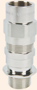
Steel pipe wiring