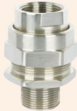
Steel pipe wiring